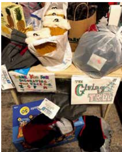
The Giving Tree Gifts