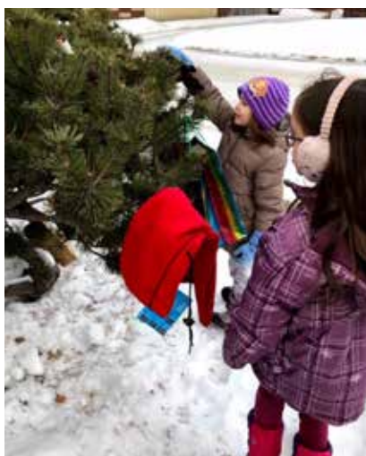
Decorating The Tree With Gifts