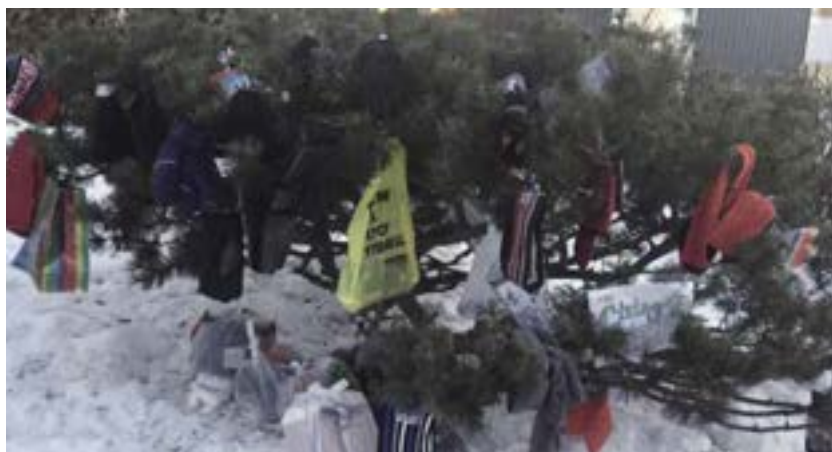
The Giving Tree Filled With Gifts