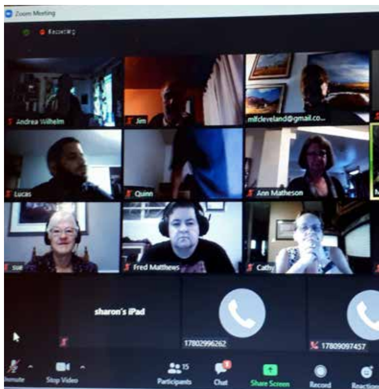
Annual Board Retreat In Pandemic Times