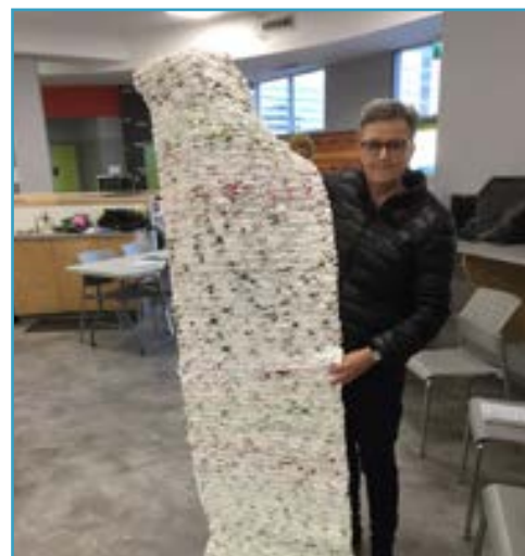
SLEEPING MAT MADE FROM PLASTIC BAGS FOR LIVING ROUGH