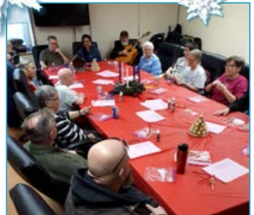
STAFF & VOLUNTEER LUNCH