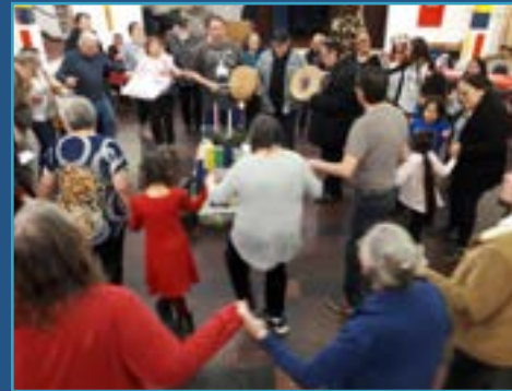
MINI ROUND DANCE