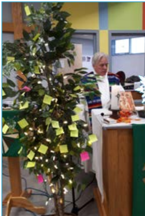
ICPM THANKSGIVING TREE

Another exciting year has passed in the ministry of ICPM. The introduction of a new Board Chair, Treasurer, Secretary and two new Lutheran Board Members; continuing program needs; and financial challenges filled the calendar!