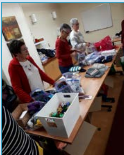
PREPARING CHRISTMAS BAGS