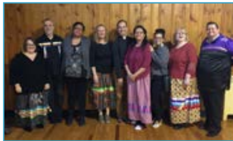
ADVISORY GROUP - OUR COMMON GROUND